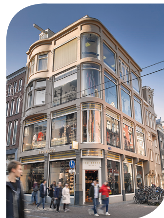
Ted Baker, Leidsestraat 64-66, Amsterdam

In the non-high street shop category, Vastned concluded 39 leases totalling € 3.3 million. The 10.7%, or € 0.4 million, negative change in rental income was mainly due to the long-term lease renewal with Media Markt for a retail warehouse in Castellón de la Plana in Spain. Vastned managed to extend the lease by eight years, but the rent was brought in line with the lower market rent. This pushed the rental income for this location down by approx. 34%, or € 0.3 million. In spite of the difficult market conditions in this segment, there were instances of rent increases on the non-high street shops. In Tilburg, Vastned concluded a lease with supermarket EM-TÉ for Westermarkt 38 at a 26% higher rent. In Belgium, 'baanwinkels' remain very popular among both retailers and consumers. In retail park 't Gouden Kruispunt in Tielt-Winge Vastned concluded successful leases with Trendy (+27%) and Big Bazar (+36%).