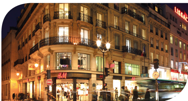
H&M, Rue de Rivoli 118-120, Paris