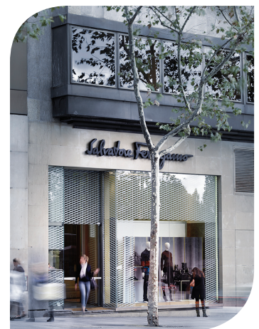
Salvatore Ferragamo, Calle Serrano 36, Madrid

The gross rental income fell from € 96.4 million in 2014 to € 93.2 million in 2015. The main reason for the decrease was the rotation in the portfolio towards higher quality, whereby more risky assets, i.e. higher yielding assets, were sold and less risky assets, i.e. lower yielding assets, were acquired. The table on page 12 provides an extensive breakdown by type and country of the developments in the gross rental income.